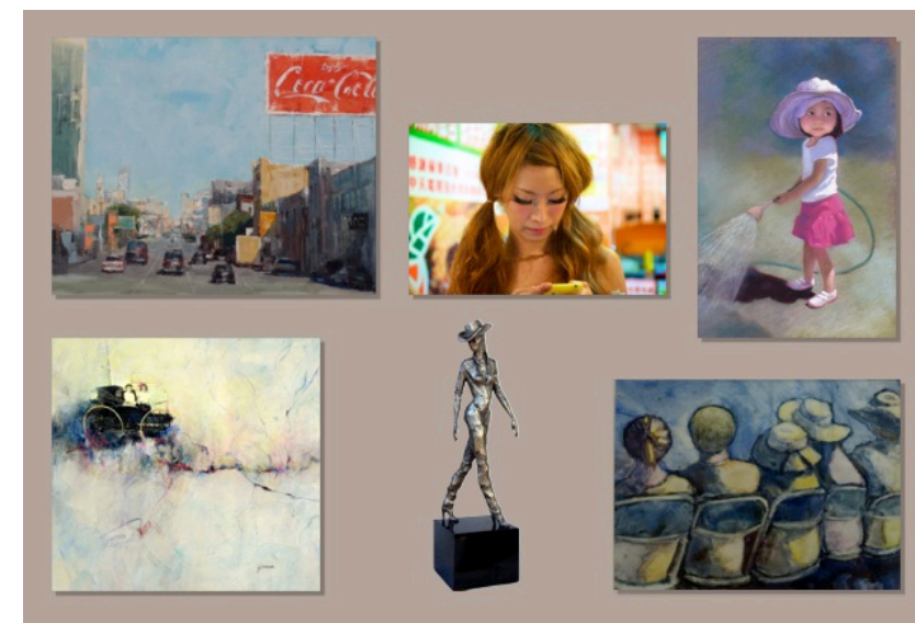
Fall 2012 First Place Winners