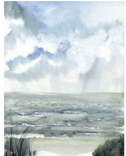
Kay Culpepper - Seascape I