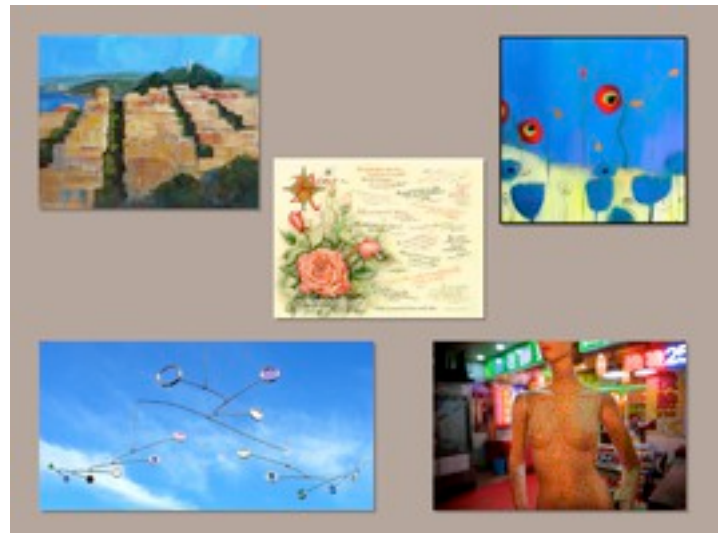
Fall 2014 First Place Winners