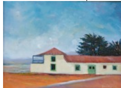
Al Shamle - Old Custom House

Al Shamle's Old Custom House received a First Place Award at the Monterey Bay Foundations' "Art in the Gardens" Plein Air event in September.