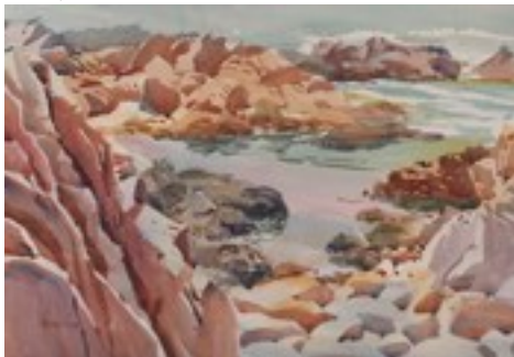
Veronica Gross - Asilomar Beach Egret

Veronica Gross's Asilomar Beach Egret won first place in the Watercolor West 47th Annual Juried International Exhibition 2015 - at the Brea Cultural Center in Brea, CA until December 13.