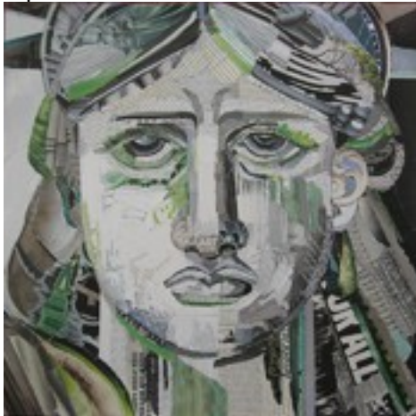
Laurie Barna - The Face of Liberty

Laurie Barna's The Face of Liberty has been juried into the "Incite 3: The Art of Storytelling, the Best of Mixed Media" to be published by North Light Books in September.