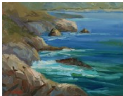
Ellen Howard - Coastal Views

Ellen Howard had 2 paintings accepted into the Plein Air Southwest Salon Exhibition.