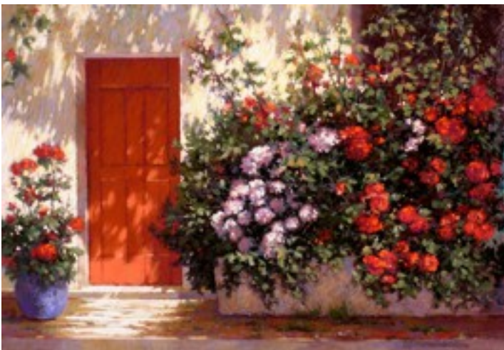
Claire Schroeven Verbiest - Curb Appeal

color, she teaches watercolor and pastel painting classes, conducts painting workshops throughout the US, Canada and Europe and frequently serves as a juror for local art shows.