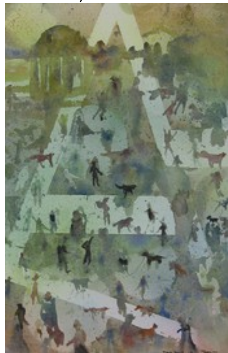
Zoya Scholis - Dog Park

Zoya Scholis' Dog Park was juried into the Arc Gallery for their "Fusion" show.