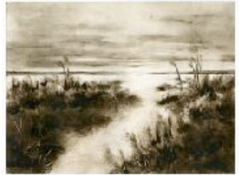
Rozanne Hermelyn - Path to Infinity

Her print Path to Infinity and her Illuminate monotype table lamps, were accepted into the Pacific Art League Holiday show and art market.