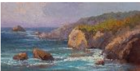
Ellen Howard - Coastal Reflections

Ellen Howard's painting Coastal Reflections was accepted into the Outdoor Painters Society's Southwest Plein Air Salon, April, 2017.