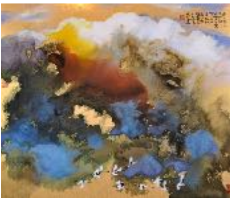
May Shei - Cranes Visit Formosa

May Shei - Pacific Art League, 2017 January Jury Show first place, Cranes Visit Formosa , contemporary Chinese painting.