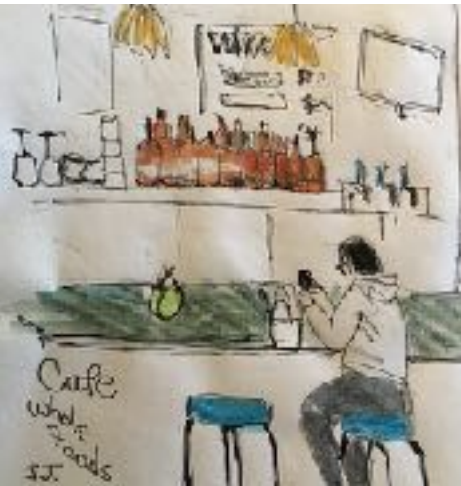
Last Thursday Sketchers - Quick Sketch

Bobbie Frederickson's "Last Thursday Sketchers" A quick sketch from the February group meeting which was held at Whole Foods. Meeting sites will include such places as a café at Westgate Mall and Summerwinds Nursery in Campbell.