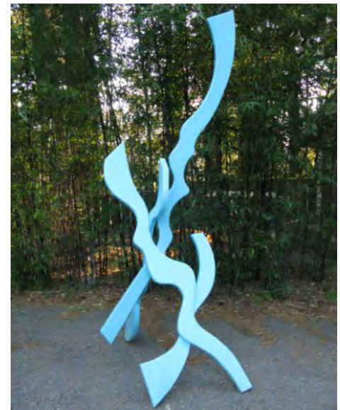
Sid Dunton - Fuego Azul

Sid Dunton's sculpture Fuego Azul is being displayed in the Sierra Azul nursery along with ninety plus others through October 31. The beautiful Nursery and Gardens are a delight to walk through and is located at 2660 East Lake Ave., Watsonville (Highway 152, across from the fairgrounds). His wall piece, Diamonds , has been selected in the members' exhibition of Pajaro Valley Arts. And Flowers is on display at the Pacific Art League in Palo Alto.