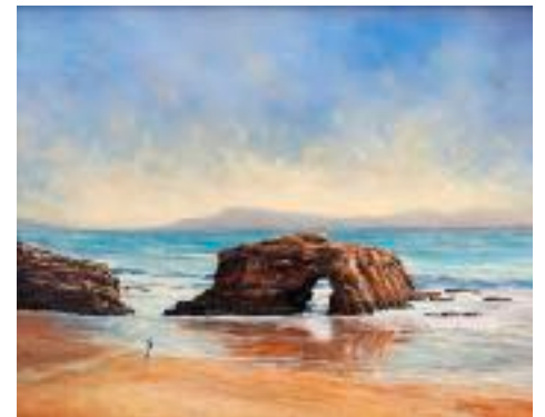
Al Shambles - Lonesome Natural Bridge

Al Shambles Lonesome Natural Bridge has been juried into the Triton Museum of Arts: 2017 Salon at the Triton 2D Competition and Exhibition which is in progress until February 4, 2018.