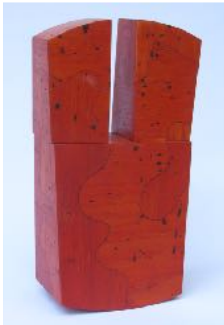
Sculpture—First Place Syd Dunton Rocker

(See the complete list of winners on Page 4.)