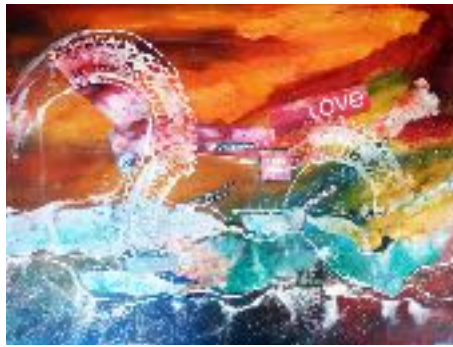
Abstract—First Place Kay Duffy, collage Cocoa Love