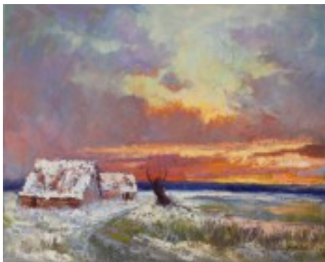
Brigitte Curt - Sunset over the Northern Land

Brigitte Curt received Best of Show at the 4 th Paint Burlingame Plein Air competition. Her Sunset over the Northern Land is included in the Pacific Art League "Scapes" competition.