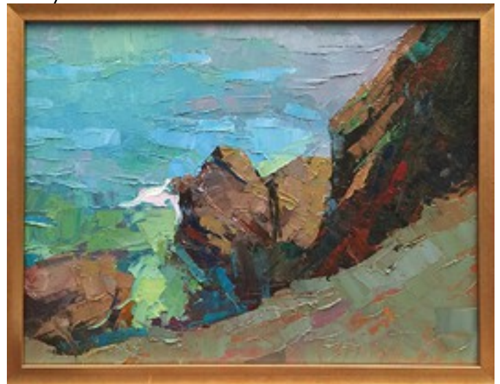
Ann McMillan - Mendocino Water Colors